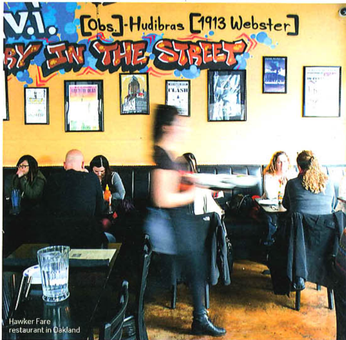
Hawker Fare restaurant in Oakland

Sometimes the most interesting travel destinations are the ones in transition. Enter Oakland, where a small business renaissance is good news for a city that's endured its share of crime and drugs over the years and bad news for residents being priced out of suddenly trendy areas such as Rockridge, Temescal and Grand Lake. For better or worse, the gentrification of the East Bay adds up to compelling tourism. Plan your trip around Oakland's restaurant scene, which is at turns high-minded and down-home. For the former, try Michelin-starred Commis on Piedmont Avenue and the newly opened Japanese-American joint Hopscotch in Uptown, or go casual with a burrito at Cactus Taqueria in Rockridge or an Asian rice bowl at Hawker Fare on Webster Street. Good cooking isn't the only change agent in town. Manifesto (scrappy bike shop), Blue Bottle Coffee (best cup in town), Marisa Haskell (gorgeous jewelry) and the Fox Theater (beautifully restored 1920s performance space) all believe in their city's revival, and you might, too, after a long weekend here. commisrestaurant.com , hopscotchoakland.com , cactustaqueria.com , hawkerfare.com , wearemanifesto.com , bluebottlecoffee.com , marisahaskell.bigcartel.com , thefoxoakland.com